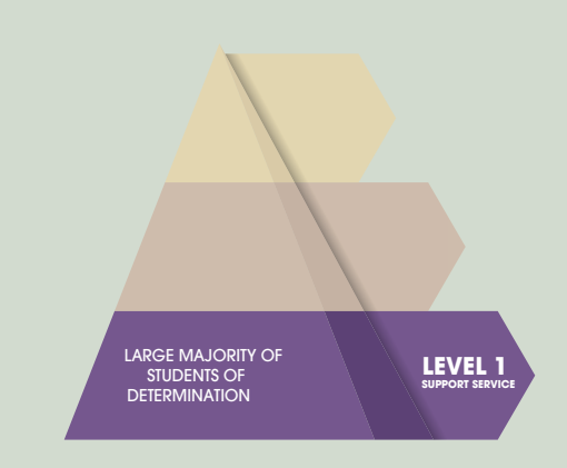
LEVEL 1 - GENERAL SUPPORT SERVICE

High quality differentiated teaching in the classroom. It is expected that the large majority of students of determination will be sufficiently supported through this level of support.