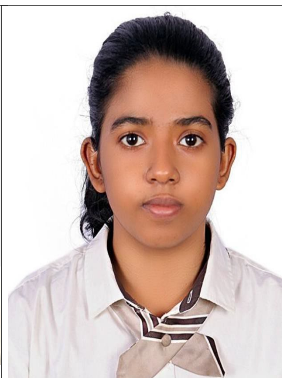
BIJNA THOMAS (93%)